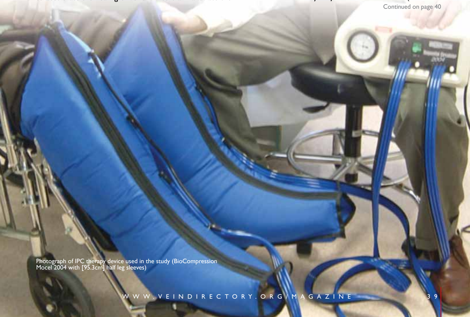
Photograph of IPC therapy device used in the study (BioCompression Model 2004 with [95.3cm] half leg sleeves)