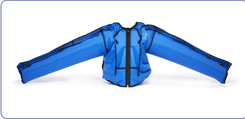
HCPCS: E0657 - Chest E0668 - Arm