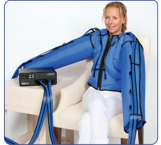
Part Number: GV-3010-S-2/M-2/L-2