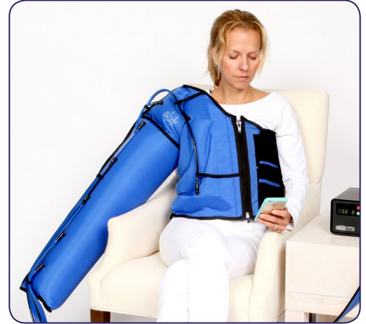
Upper Extremity/8 Chamber Garment Sizing Chart