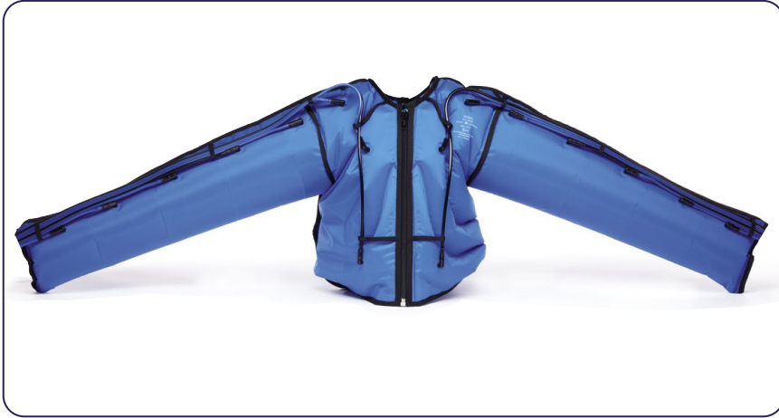
HPCS: E0657 – Chest E0668 – Arm