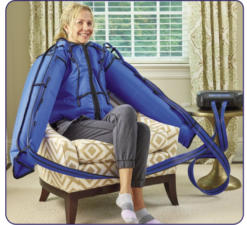
Part Number: GV-3010-S-2/M-2/L-2